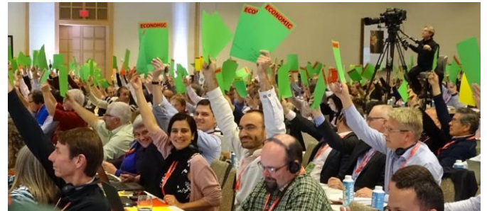
Voting session at the FSC General Assembly 2017

We work with private and public forest owners and managers. Our customers range from smallholdings less than a hectare in area to key suppliers of globally leading companies. We certify a total forest area of over 33 million hectares. These forests are located around the world, from Europe to Russia and Asia.