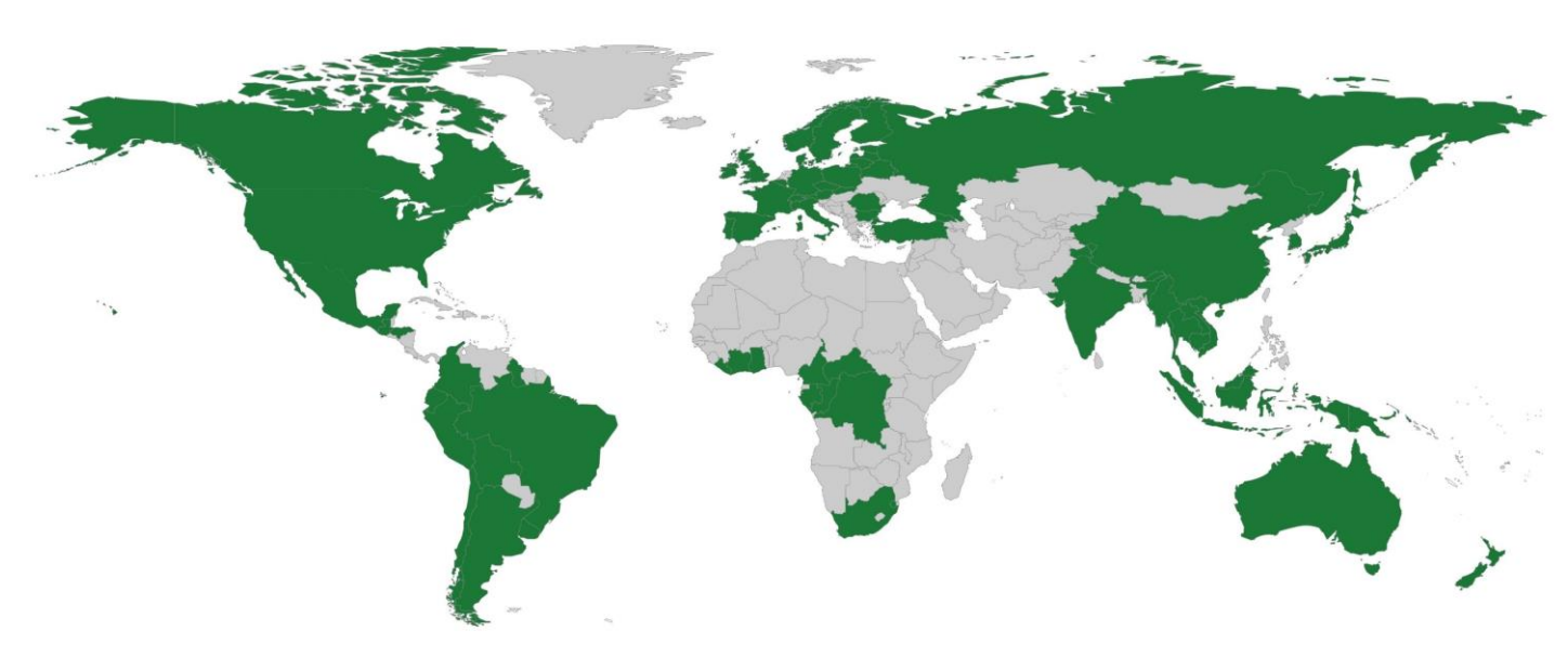
Figure 1. Countries for which NEPCon have developed a legality risk assessment for timber

In that time, NEPCon have developed timber risk assessments for more than 60 countries, illustrated in Figure 1.